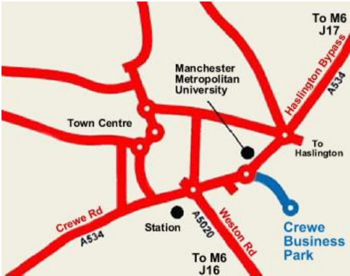
Boldon James offices on the Business Park in Crewe